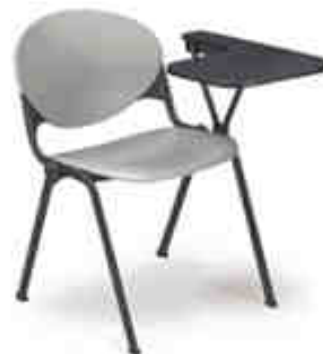
PRIMA lecture chair with a V-