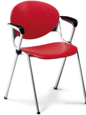
Polyprop 'pumpkin' seat & back / chrome frame / aluminium armrest