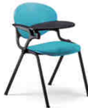
Polyprop 'spring' seat & back / black powdercoat frame / dual angle anti-panic writing tablet in ABS