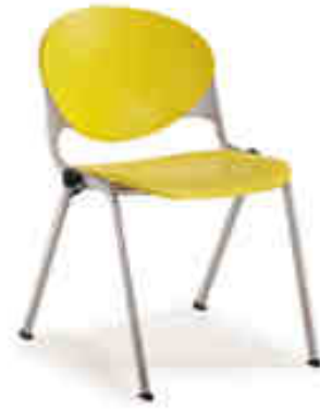
Polyprop 'corn' seat & back /