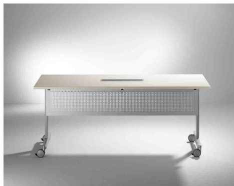
n-table with modesty