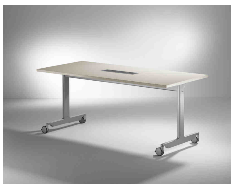
n-table without modesty