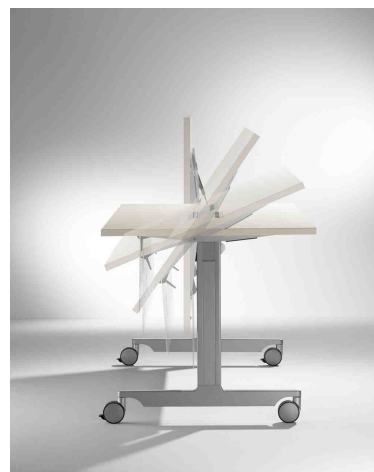
space saving storage