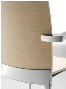
Wooden Seat & Back