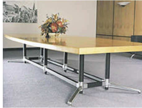
bct10 - customised