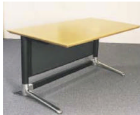
bct22 with modesty