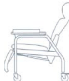
REMOVABLE FOOD TRAY